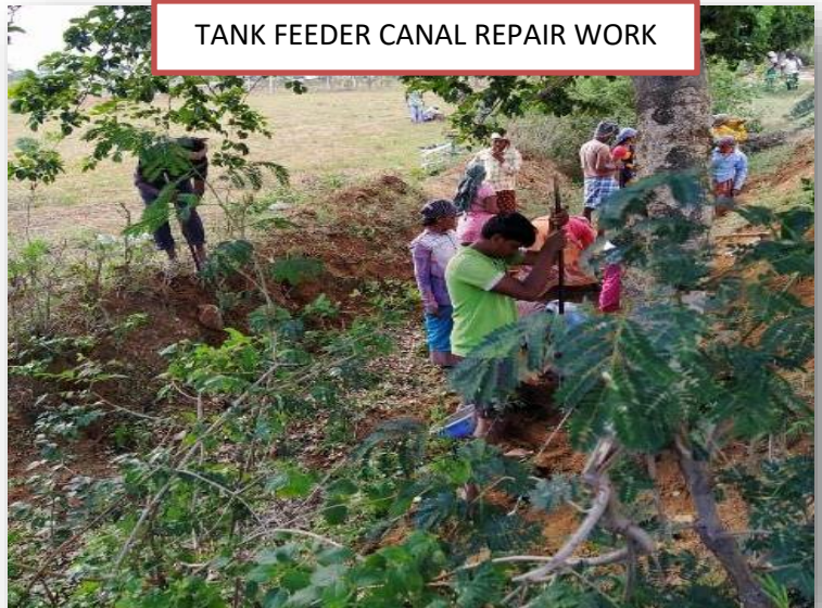
TANK FEEDER CANAL REPAIR WORK

The feeder channel to Village Lake was repaired. During monsoon times rain water flows in this channel and it ends up into the village irrigation lake/pond (TANK). This water is used by the farmers in tank the command area to grow rice crop. Lots of bushes have grown up in this feeder channel which obstructs smooth flow into the lake. Because of the bushes grown in the feeder channel sometimes water does not flow into the tank and it goes all over and this will cause “not enough water” in the lake and create problem for farmers. This feeder channel was repaired. For which the people of Doddignahalli got from MGNREGA scheme of Grama Panchayat.