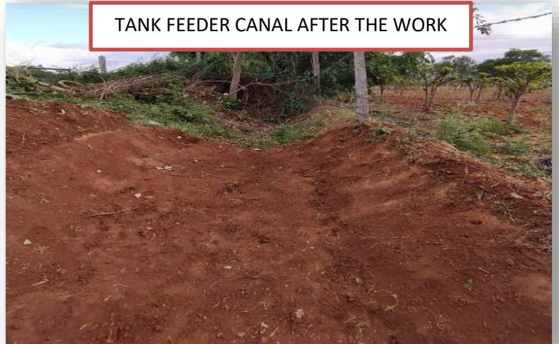
TANK FEEDER CANAL AFTER THE WORK