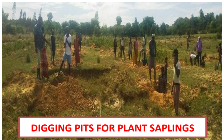
DIGGING PITS FOR PLANT SAPLINGS

In this village on the foreshore area of village lake/pond/tank 305 pits were dug of 3 feet width x 3 feet length and 3 feet depth i.e. one Cubic Meter. This was to plant water resistant forest saplings and these trees provide fruits to birds and green manure to farmer's rice farms.